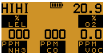
Display in alarm conditions