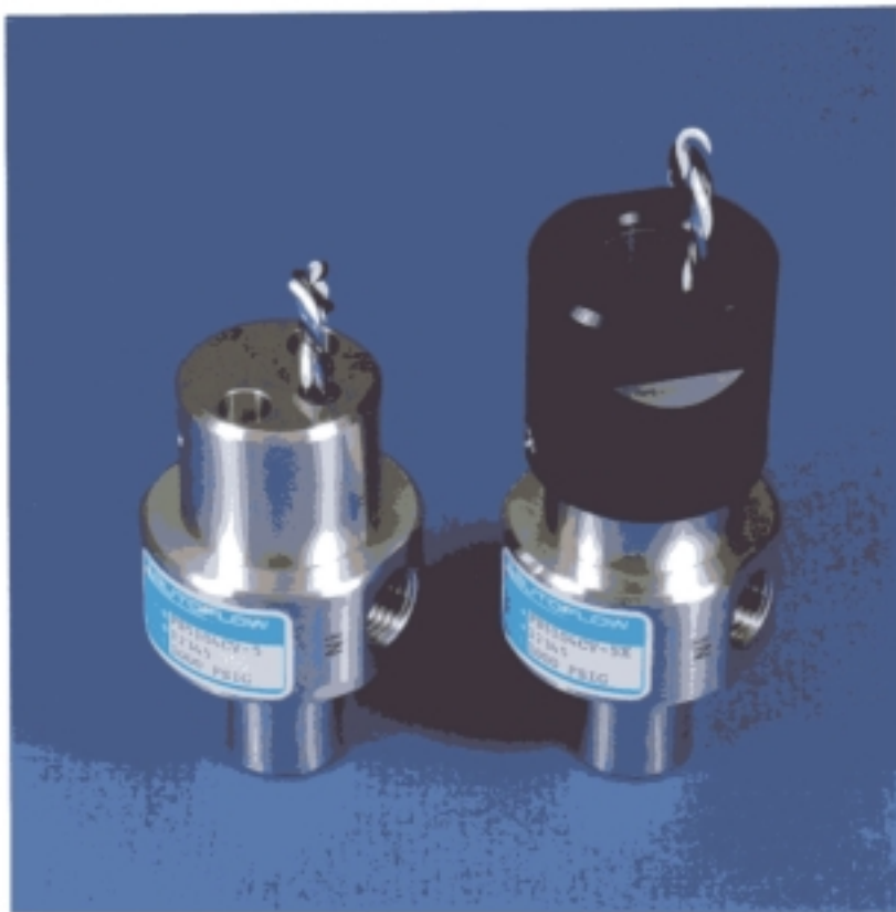
FS5100 Series Flow Switch - High Flow available with 1/4 and 1/2 NPT Connections with optional Explosion Proof Cap