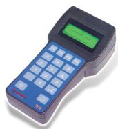
TLU Wireless (IR) Hand-held Terminal