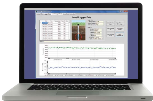
LevelLink PC Application

Advanced features include, density correction, manual barometric pressure correction, salinity and EC correction, field zero correction, averaging and automatic depth to water corrections. A bulk data correction facility is also available to compensate multiple LevelLine files at once. Data can be exported in raw or compensated formats into .csv formats for further processing outside of the LevelLink application.