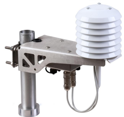
MetConnect THP combining temperature , humidity and pressure and measurements from user selected sensors