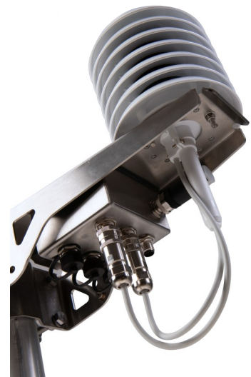
MetConnect connectors allow expansion and provide high IP rating

For pricing or any further information, please contact Omni Instruments Ltd.