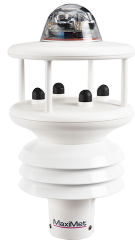
MaxiMet GMX600 measures 6 parameters including precipitation.

For pricing or any further information, please contact Omni Instruments Ltd.