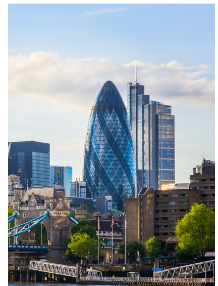
MaxiMet compact weather stations are integrated into systems monitoring gas and particulate concentrations in the air.