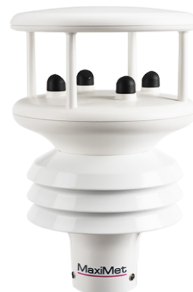
MaxiMet GMX500 measures 5 parameters.