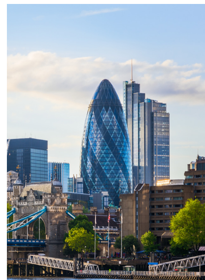
MaxiMet compact weather stations are integrated into systems monitoring gas and particulate concentrations in the air.

For pricing or any further information, please contact Omni Instruments Ltd.