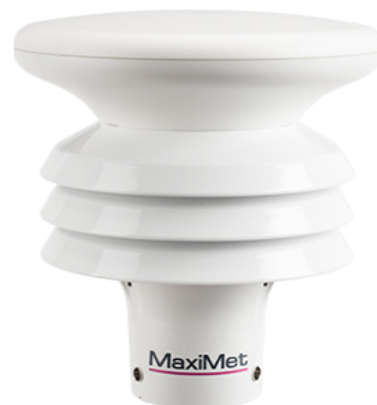
MaxiMet GMX300 measures 3 parameters.