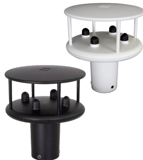
WindSonic ultrasonic anemometers offer high accuracy, low cost wind measurement