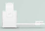
Split core CTs 50 A - 400 A