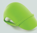
Smappee Gas & Water