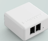
Smappee Wi-Fi Connect