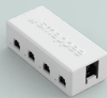
Smappee CT Hub