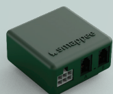
Smappee Power Box