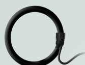
Rogowski coil 400 A - 10.000 A