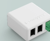
Smappee Output module