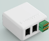
Smappee Input module