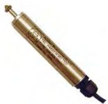
AML/SGD Displacement Sensor