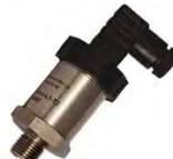
Pi600 Pressure Sensor

Whilst every effort has been made to ensure the accuracy of this specification, we cannot accept responsibility for damage, injury, loss or expense from errors or omissions. In the interest of technical improvement, this specification may be altered without notice.