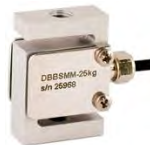
Load Cells & Force Sensors