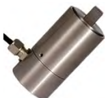
Torque Transducers & Torque Sensors