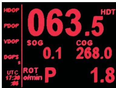
Heading and Speed