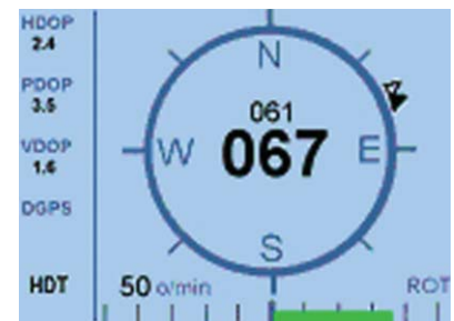
Compass Rose Heading

Additional screen displays: GPS satellite status, configure Vector G2/G2B GPS compasses and monitor NMEA 0183 generic sentences.