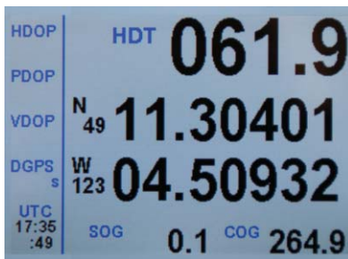
Vessel Position and Heading

The Navigator G2 displays valuable information with a touch of a button!