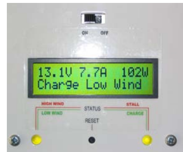
MPC1 Electronic controller with digital display (shown) is included.