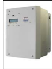
FM1803-2 model 3 blade design with MPC1 controller inset