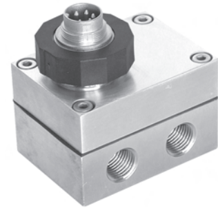
Low Pressure Version

The analog output is freely scalable via the interface. For flow measurements, the root of the differential pressure can also be outputted. The calculated value can be outputted via an analog interface (0...10 V or 4...20 mA).