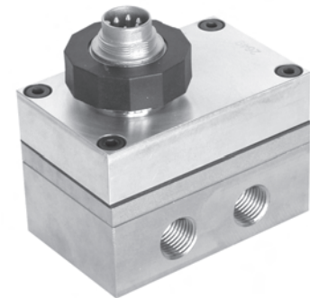
Medium Pressure Version