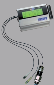
MSR255 with ext. sensors