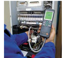
Adjustment of gas flow pressure in a gas heater (adjustment values in natural gas: 20-25 mbar)